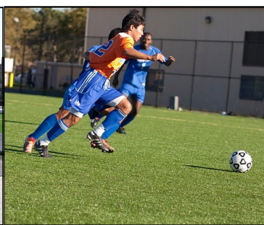
Murray Playground, NYC